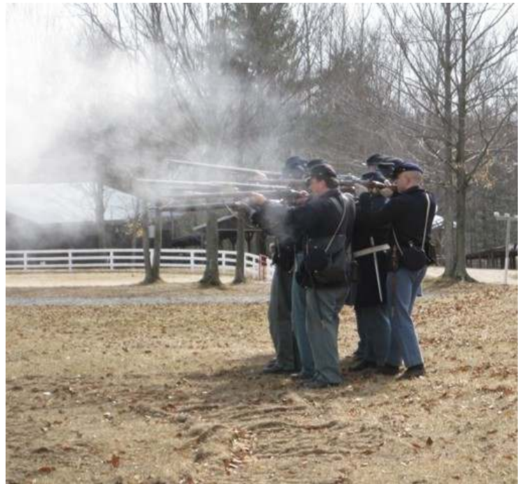
SVR Training - Firings Mar. 26-28, 2010 Lincoln, MI

excellent bonding experience with the community. We are working into our planning for the coming year to have a training session in early May on an annual basis and offering it open to all reenactors and members of Camps interested in participating with the SVR or their own Camp Guards.