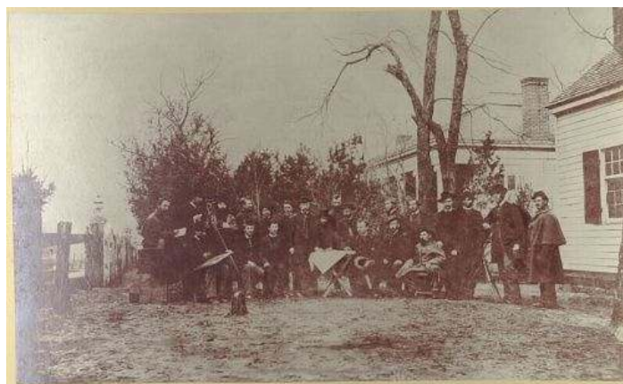
Field and Staff Officers of the 14 th Michigan Veterans Volunteer Infantry

The SVR detail serving within the boundaries of the Department of Michigan has emerged from its routine trips to Springfield and Gettysburg with a larger mission starting last year with a call to support the Lockwood Camp No. 139 at a headstone rededication service in Harrisville, Michigan on Oct. 9, 2009.